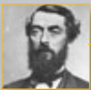
Edwin Drake (1819-1880)